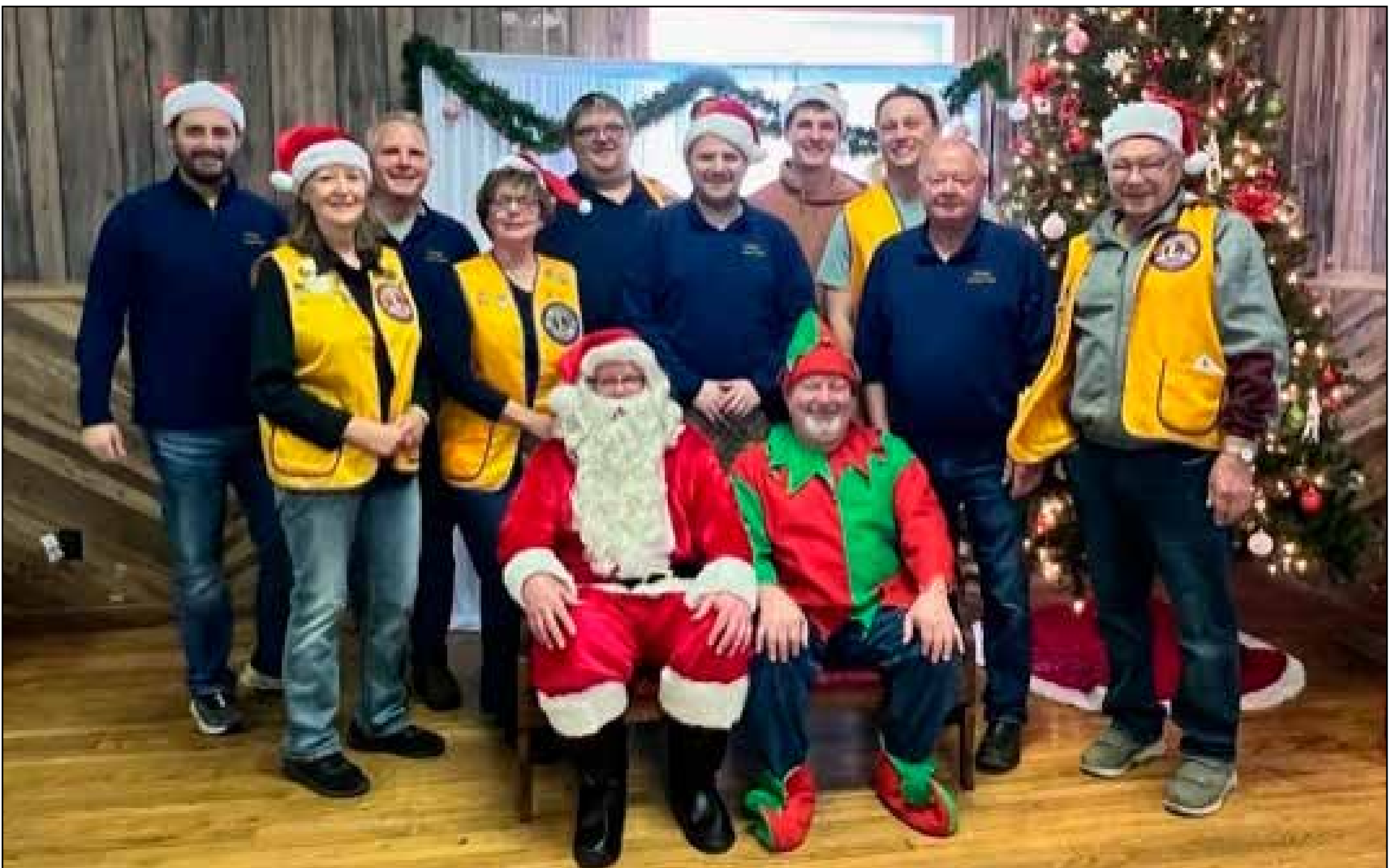
On Saturday, December 9th, the weather outside was frightful, but the Winger Lions pulled off another delightful Breakfast with Santa event at the Community Center. There was a pancake breakfast, lots of fun activities for the kids, and of course, a visit from Santa Claus.