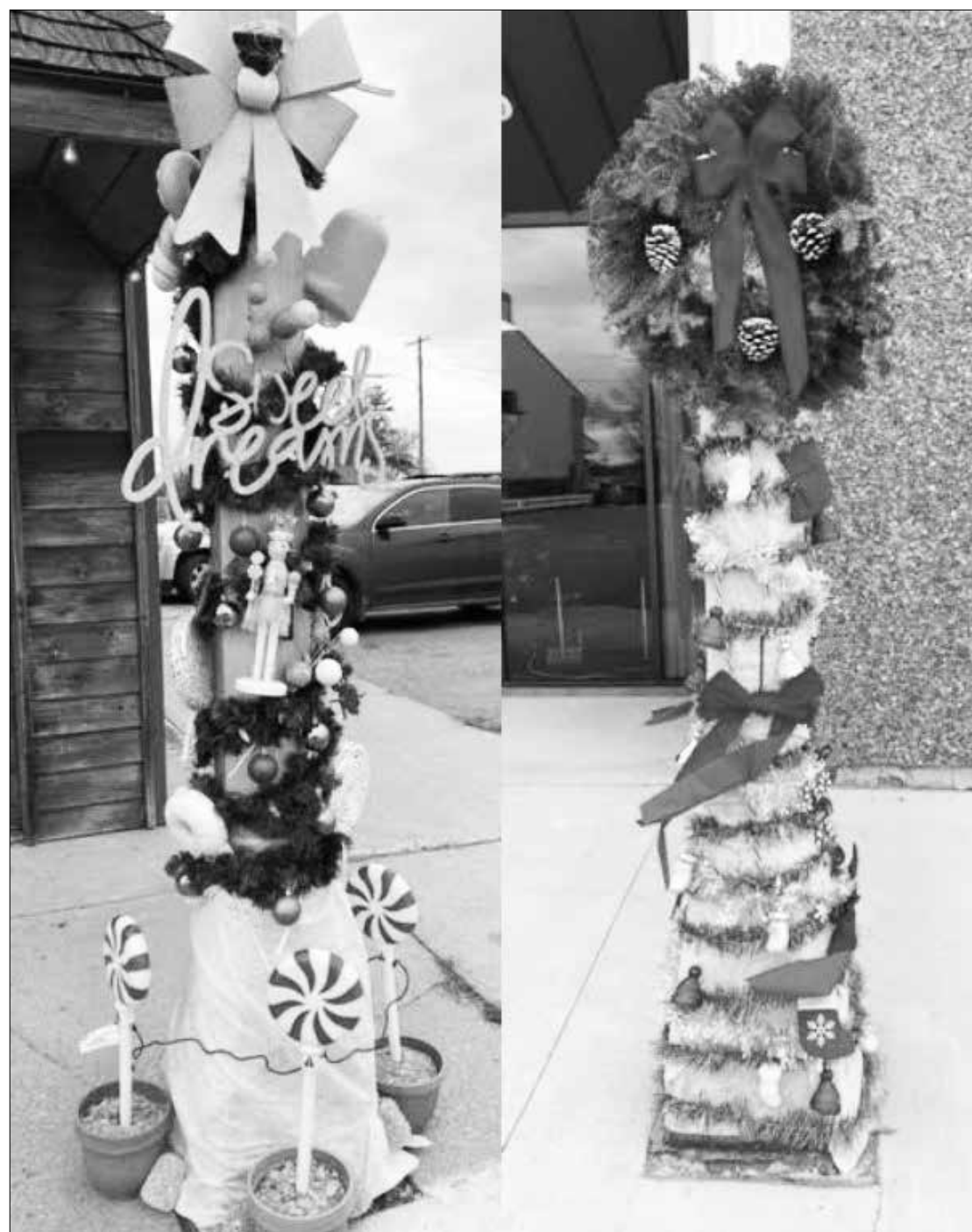
Decorated light poles for the A Very Merry McIntosh Contest. (l-r) Little Bobby's Bar & Grill and First National Bank.

pia. The churches utilize the former Julian calendar for religious observations. This places Christmas on January 7th. It also is believed that 12 days after Jesus was born, three magi visited him to shower him with blessings and gifts, an event known as the Epiphany. Some recognize Christmas as occurring on this day, which is January 6th. In fact, the "true" Christmas holiday takes place between Christ's birth and the Epiphany, or the 12 days of Christmas. Candlemas, which comes 40 days after Christmas, also is considered the official end of the Christmas season for some.