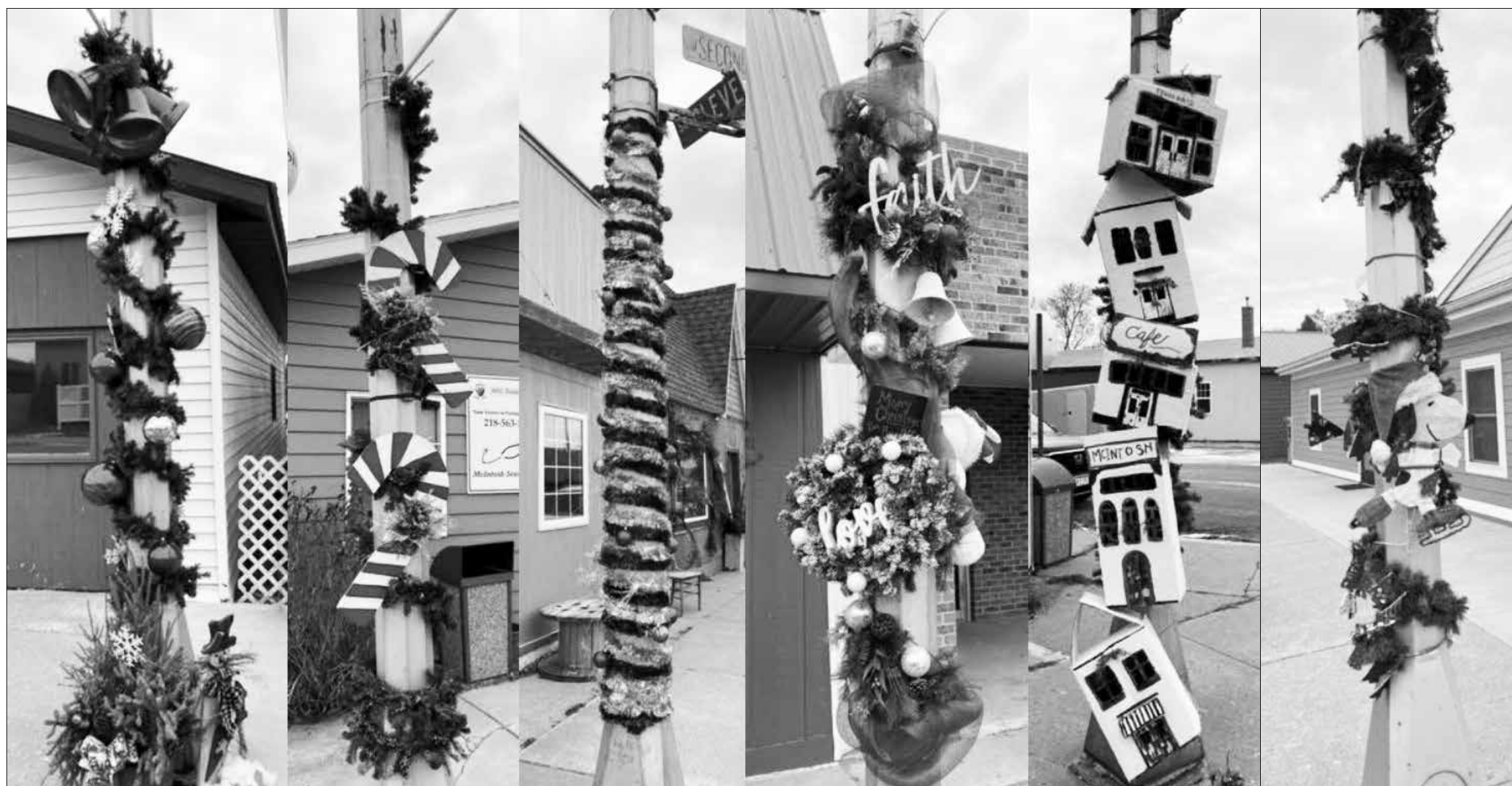
A Very Merry McIntosh light pole decorating contest for local businesses was a great success with 9 light poles decorated and the contest raised $160 to be able to sponsor a child off of Win-E-Mac schools Giving Tree, providing Christmas gifts to those in need this season. First place went to FarmChek with the Grinch theme and second place went to Minnesota Rust with The Shoppes of McIntosh theme. Pictured above (l-r) Kingtown Insurance, Our Savior's Church, Louie's Mercantile, Krissy's Hair Affair, Minnesota Rust, and McIntosh Quilters Club.