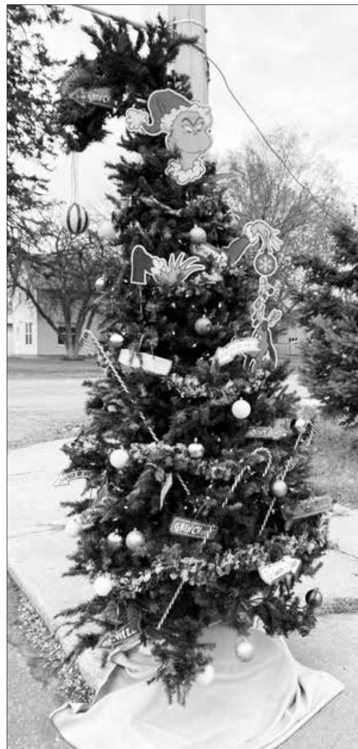
The winning light pole with 11 votes was FarmChek's Grinch tree for the A very Merry McIntosh light pole decorating contest sponsored by the McIntosh Community Club.