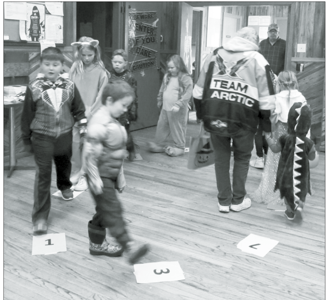
The "cake walk" game got party guests a fun treat for getting their number drawn. Part of the fun games at the Winger Community Halloween Party held on Saturday, October 28th.