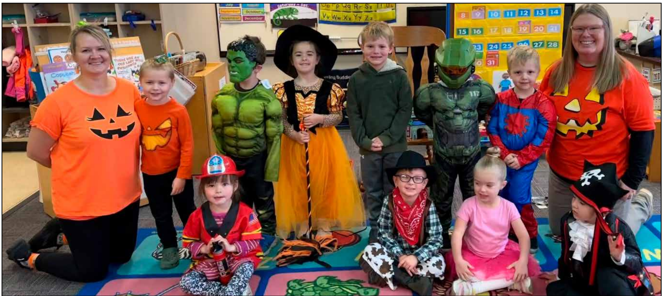
(above and below:) The Pre - K classes got into the Halloween spirit recently at Win-E-Mac School.

We offer our sincere appreciation to all of you who have served our country!