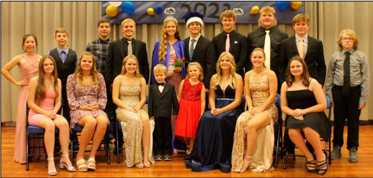
Homecoming Coronation was held for Grygla and Goodridge Schools on Monday. Here are your Chargers Royalty! More photos on the inside page.

Coming next week ... Maybe more in 2024?! New ideas welcome for the Grygla Fall Festival!