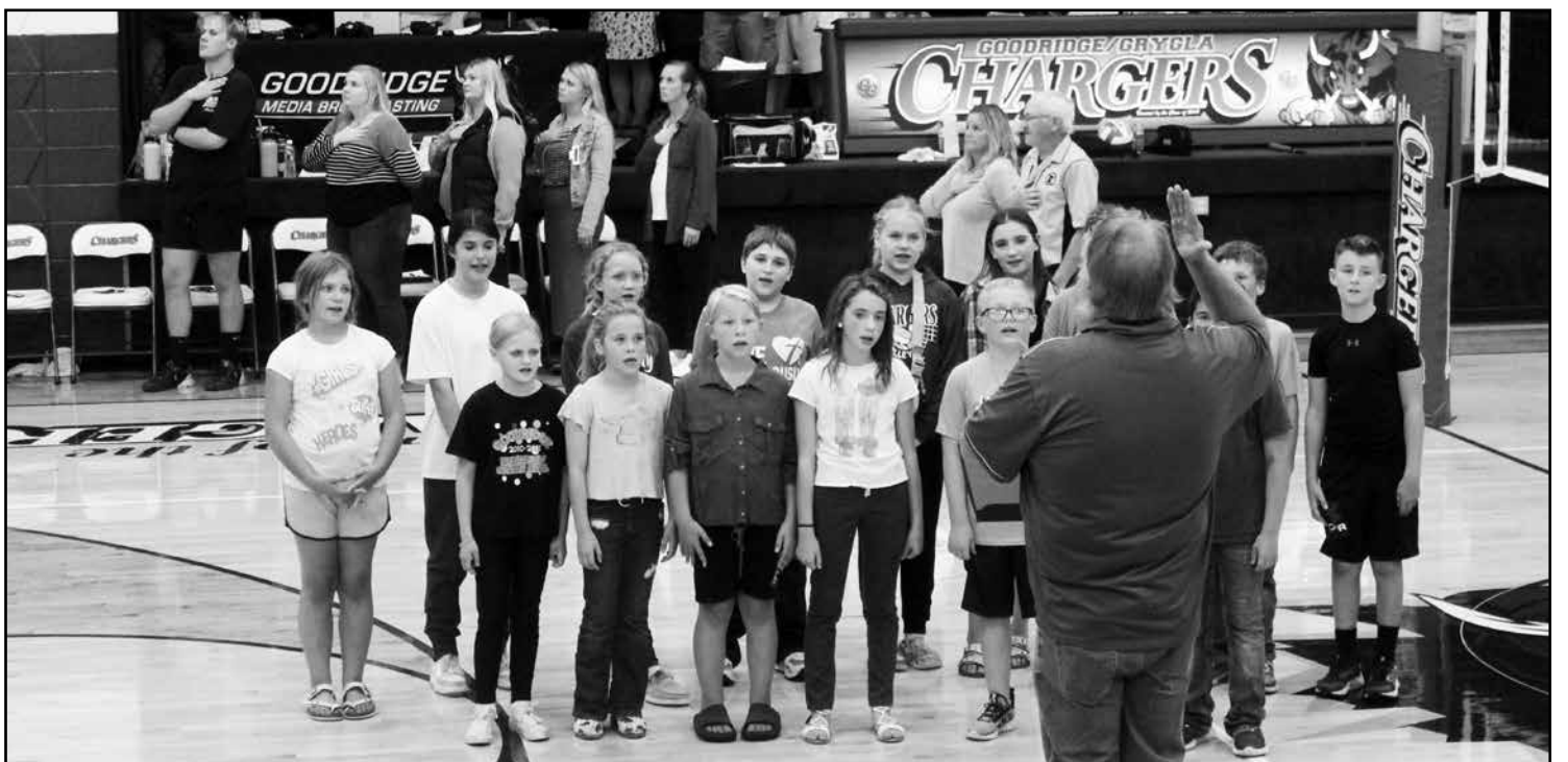
These Goodridge music students did a great job singing the Anthem at the game.