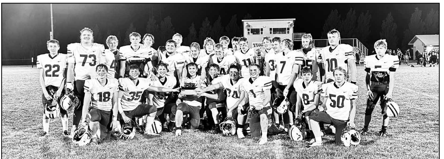
If you're looking for the "Beast of the East" traveling trophy, it'll be in the case at the Grygla School! Look at all those happy faces on the TEAM: Together Everyone Achieves More.