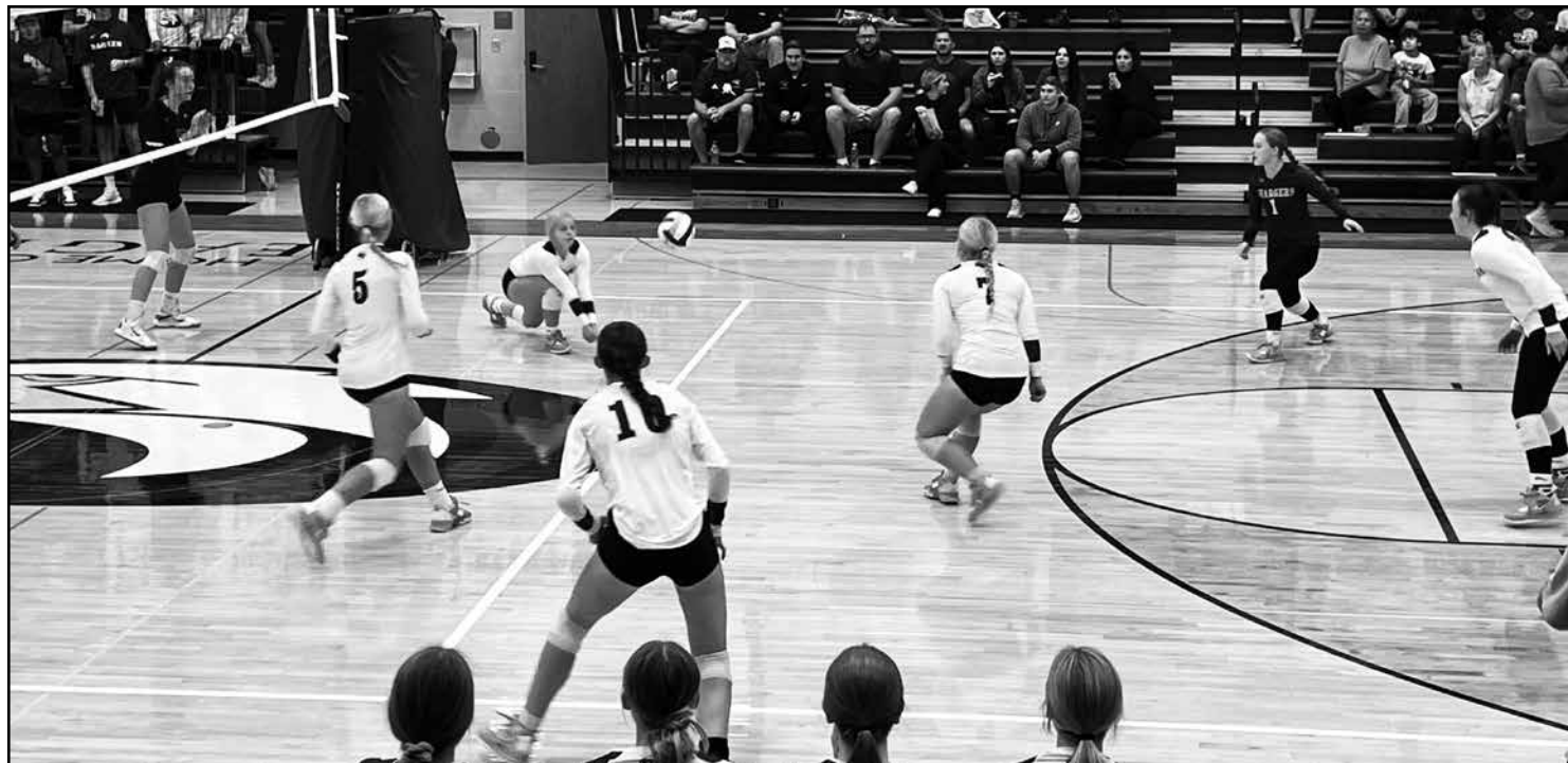
The Varsity team works the floor in Sacred Heart last week. They lost in 3 sets to the Eagles.