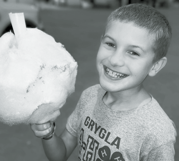
Look how much fun these current 4H kids are having! You could be a part of it all! New members/welcome meeting coming up on October 25.