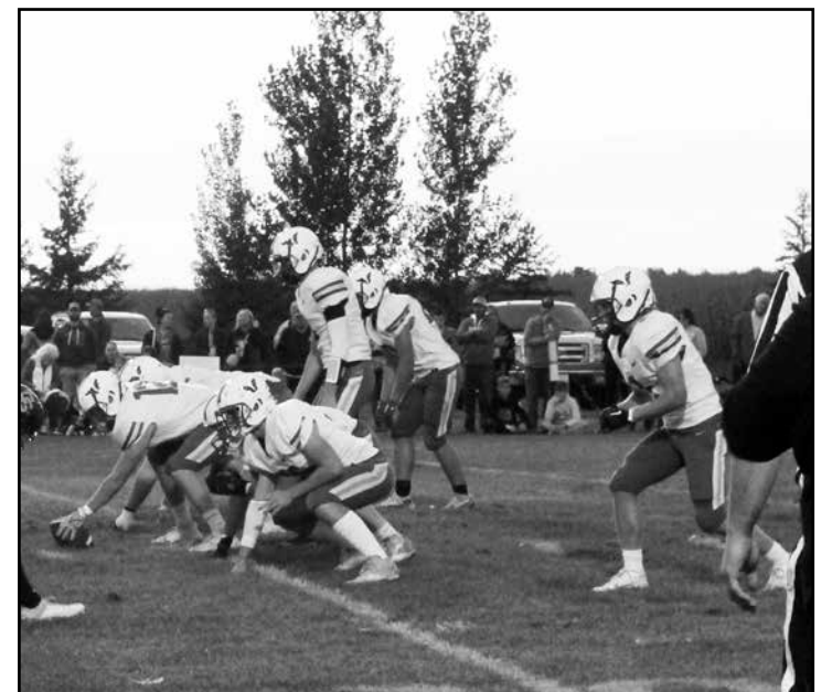
Great win for the Chargers in Clearbrook last Friday night!