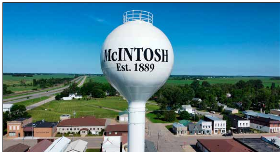
The McIntosh water tower update has been completed on the inside, and the outside received a facelift.