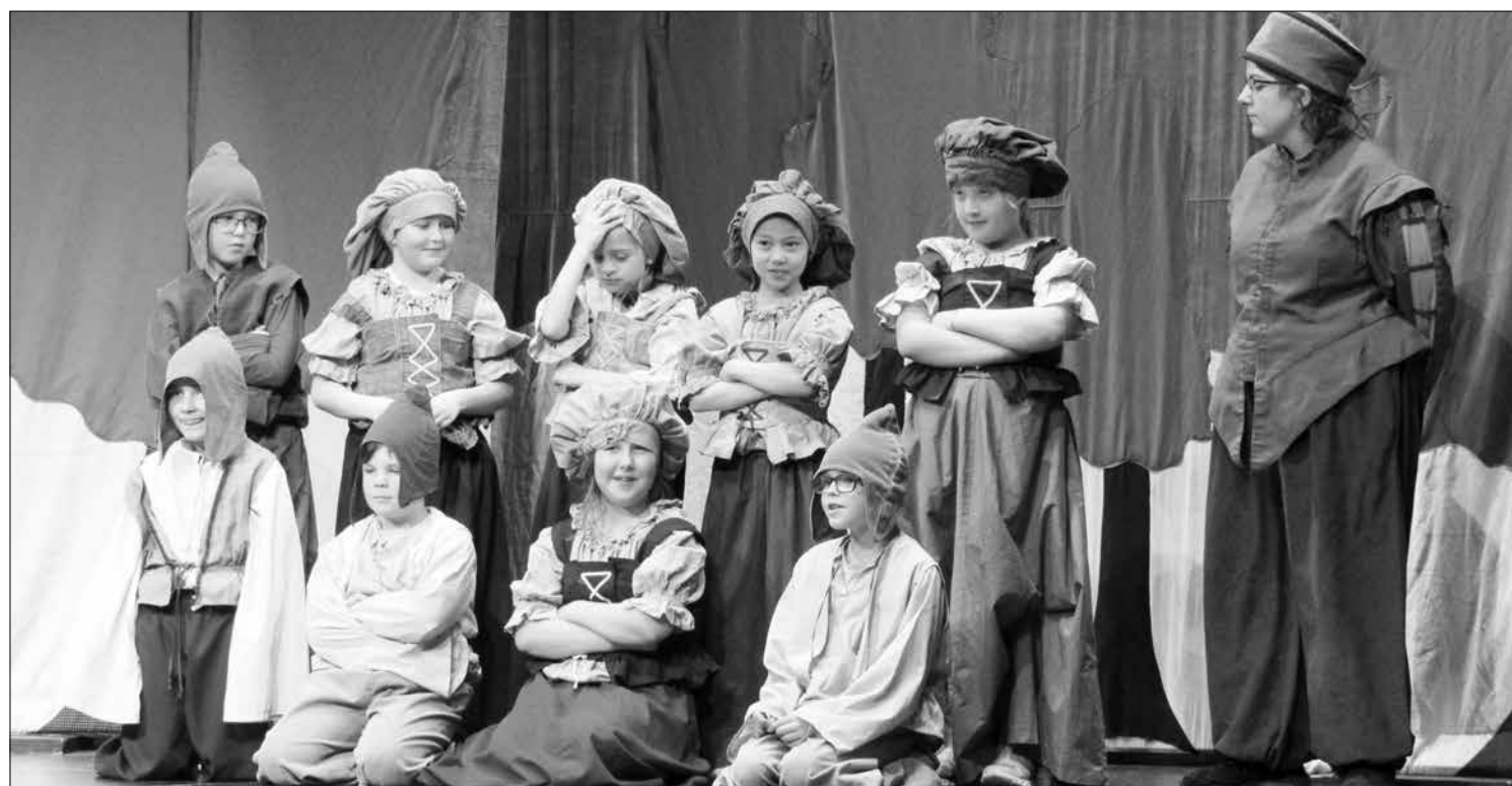
Win-E-Mac Elementary students were able to participate in a performance of the play "King Arthur's Quest" as part of a Community Education program with the Missoula Children's Theatre

Store unopened in a cool, dark place (such as cupboard or pantry) for up to 1 year.