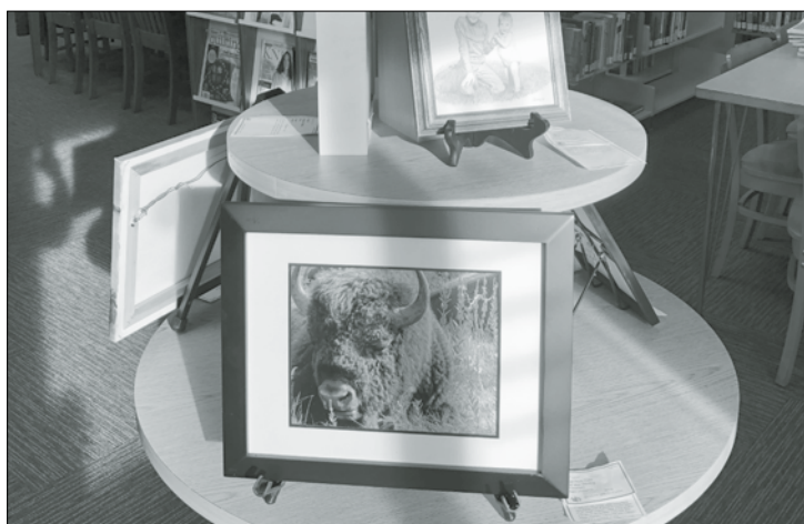
The traveling art exhibit at the Fertile Library.