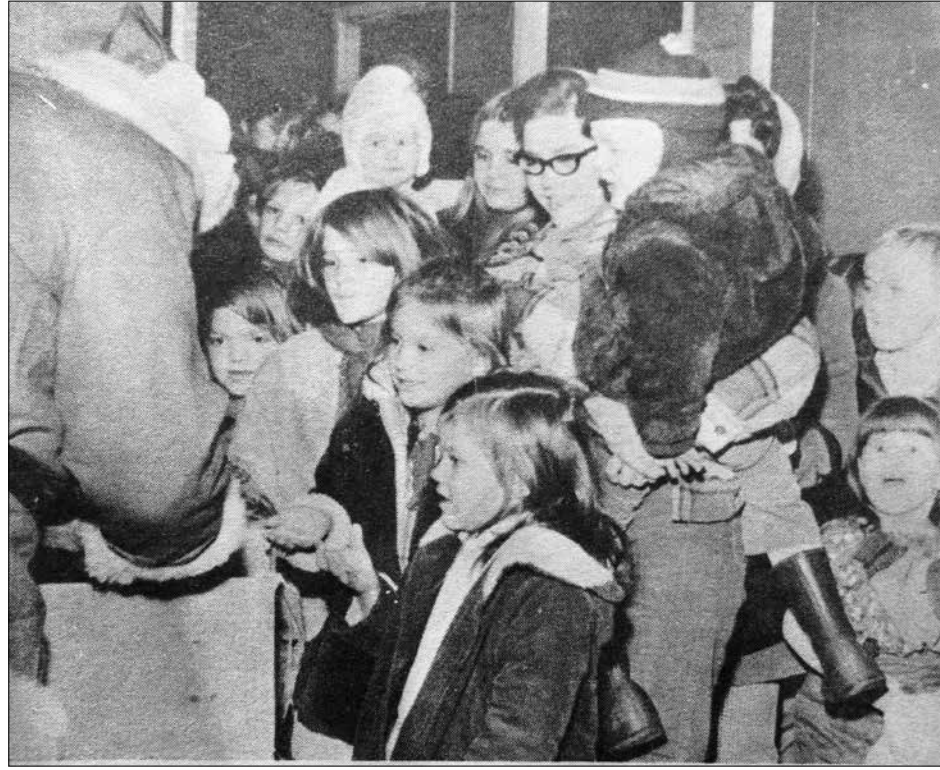
50 years ago...1971: This unidentified group of youngsters who were out to meet Santa Claus on Saturday is only representative of the hundreds of youngsters who braved the cold to visit their patron saint and collect their treats.

PIECES FROM THE PAST This column features historical photos and stories from the Winger community. Each piece is a reminder of the rich history and traditions that have shaped our town over the years. From the early days of settlement to the present, these photos capture the spirit of Winger and the people who have called it home.