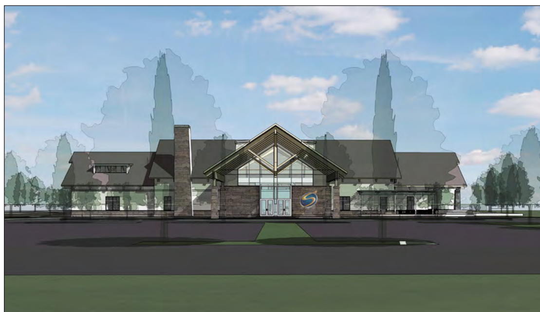
Architectural renderings of the new Shooting Star Casino that is being built south of Bagley, Minn.