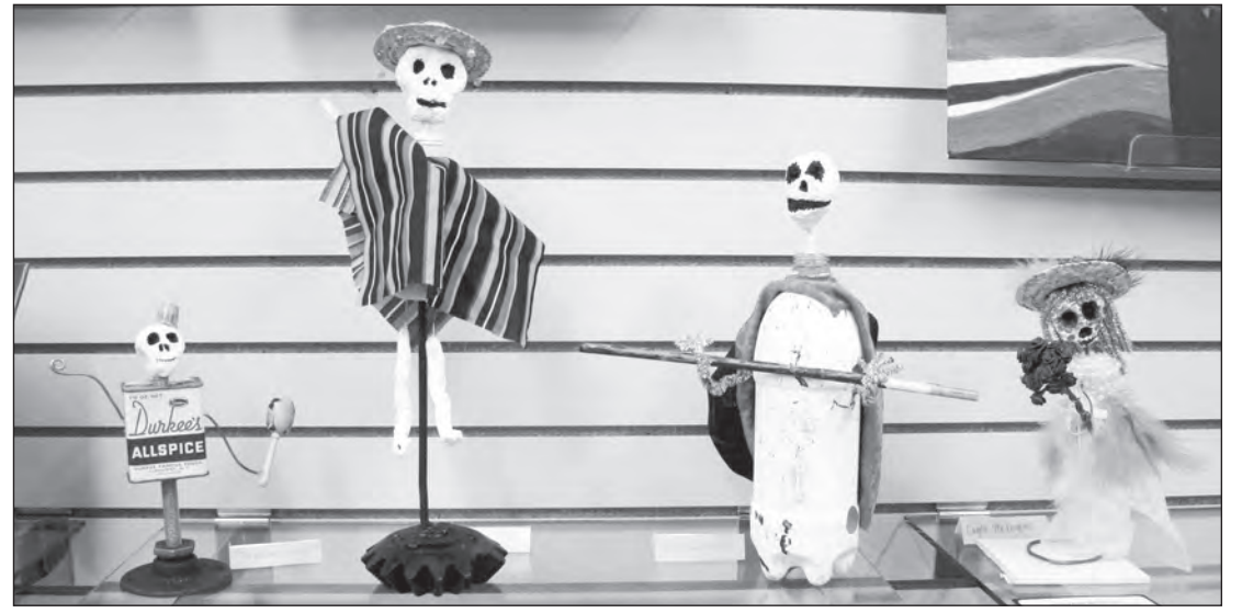
Calaca Dolls, Greenbush-Middle River students.